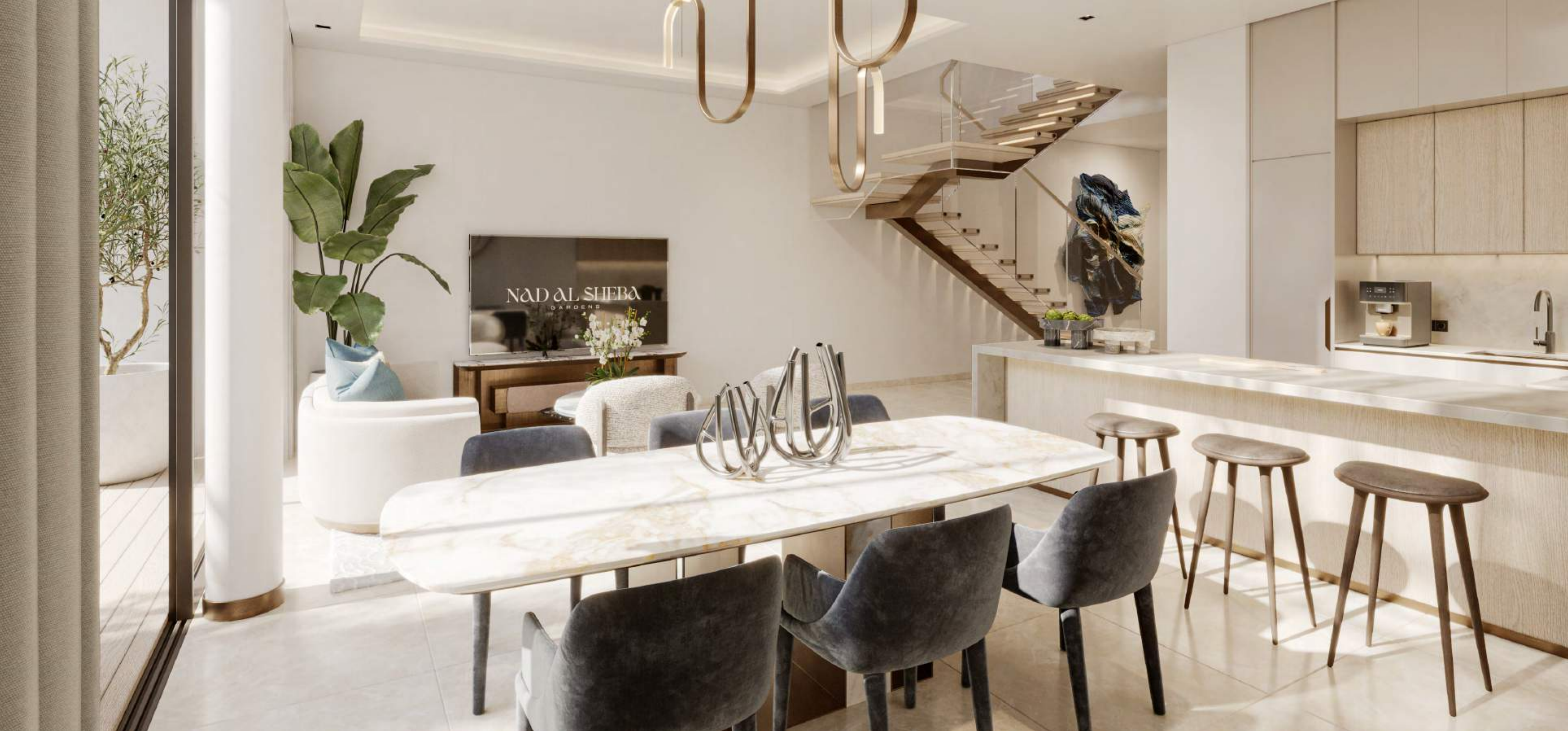
3-BEDROOM TOWNHOUSE | LIVING & DINING