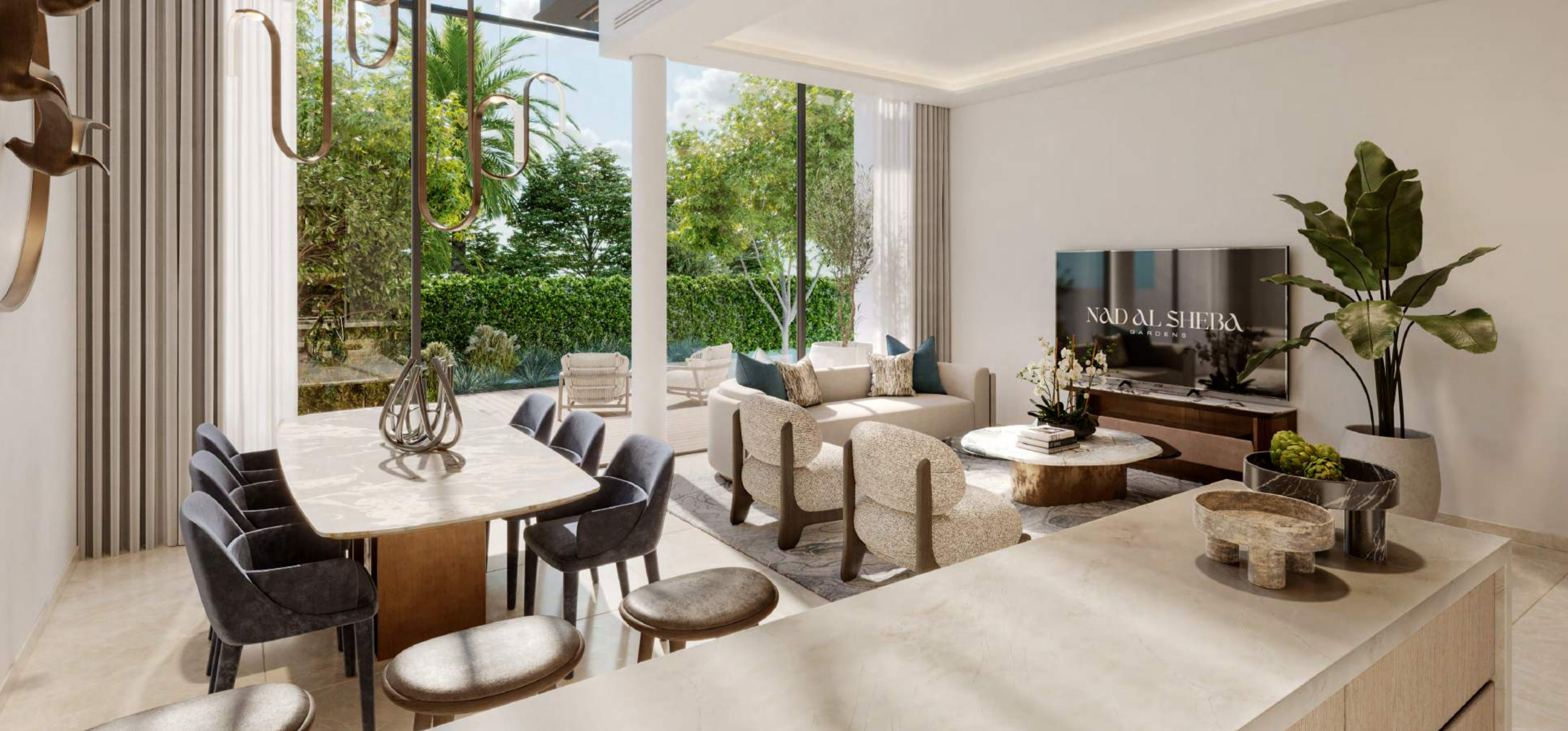
3-BEDROOM TOWNHOUSE | LIVING & DINING