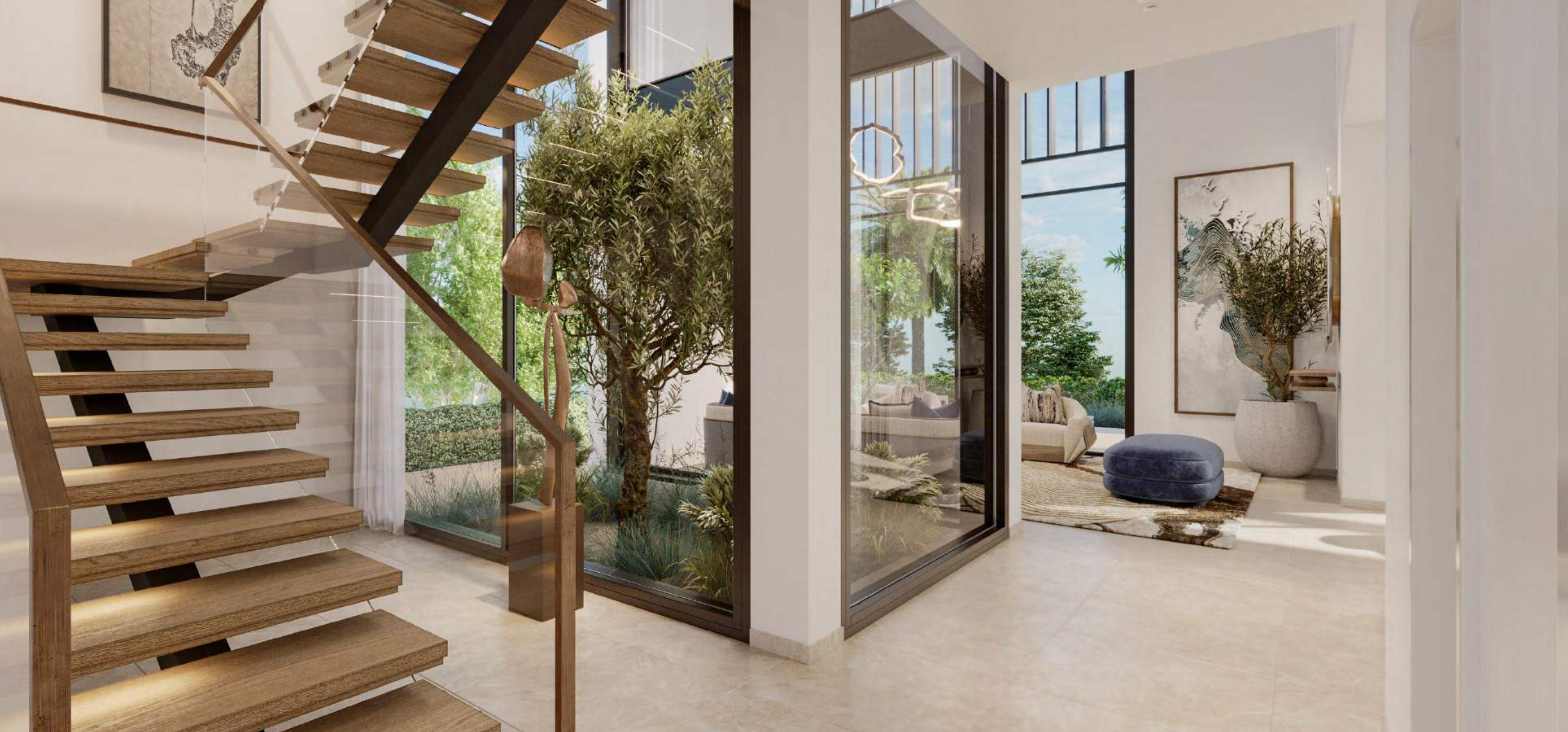
4-BEDROOM VILLA | STAIRCASE