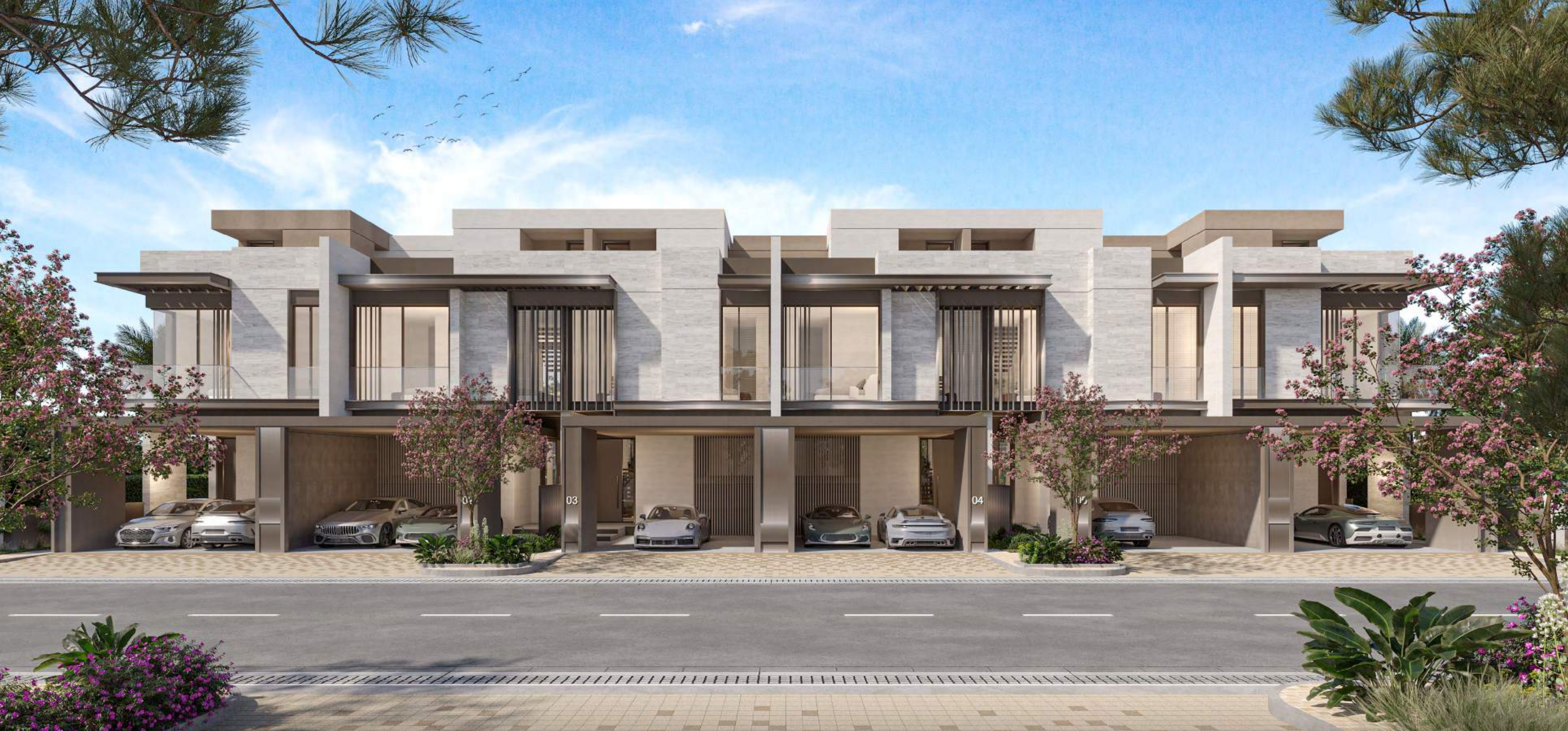
3-BEDROOM TOWNHOUSE | 6PLEX