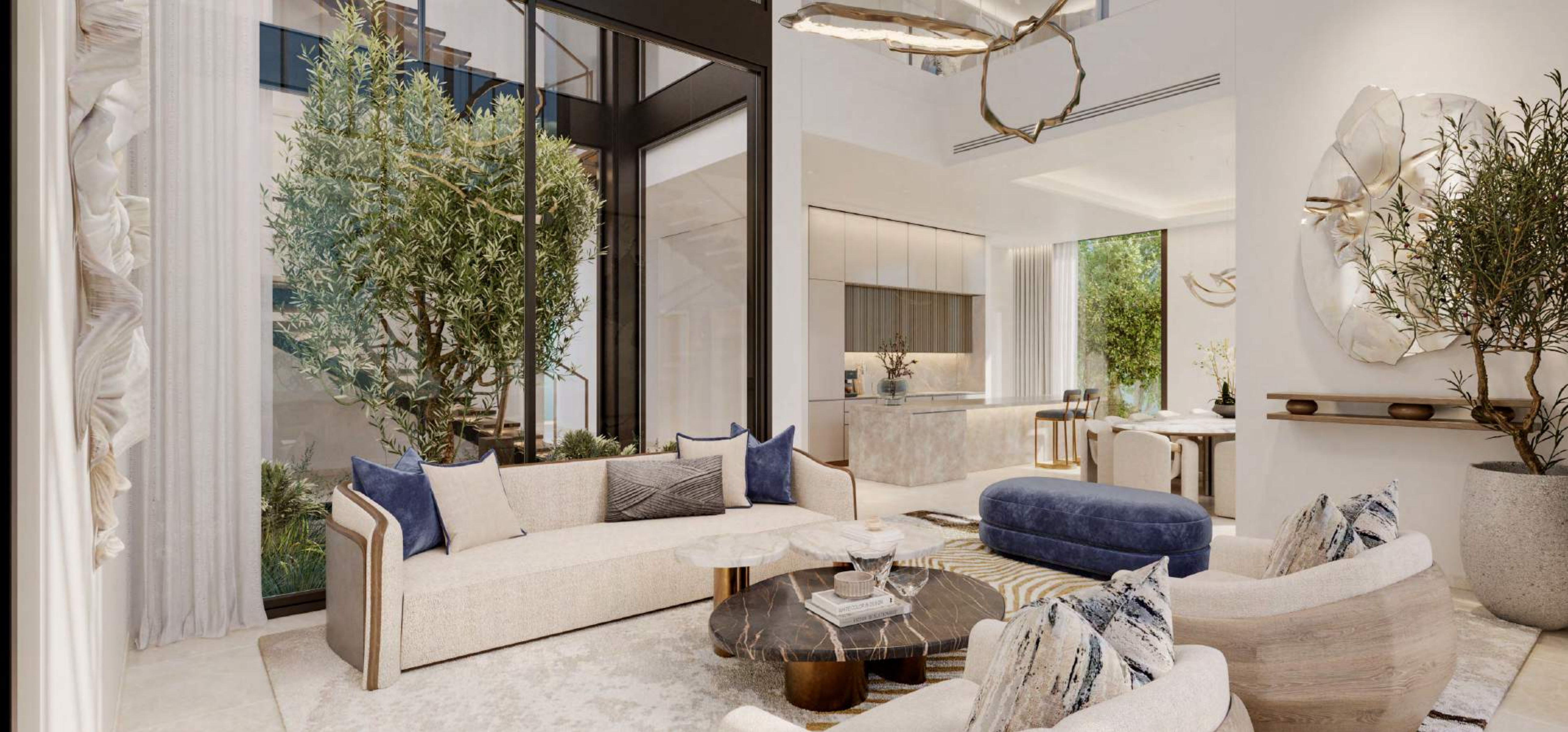
4-BEDROOM VILLA | LIVING ROOM