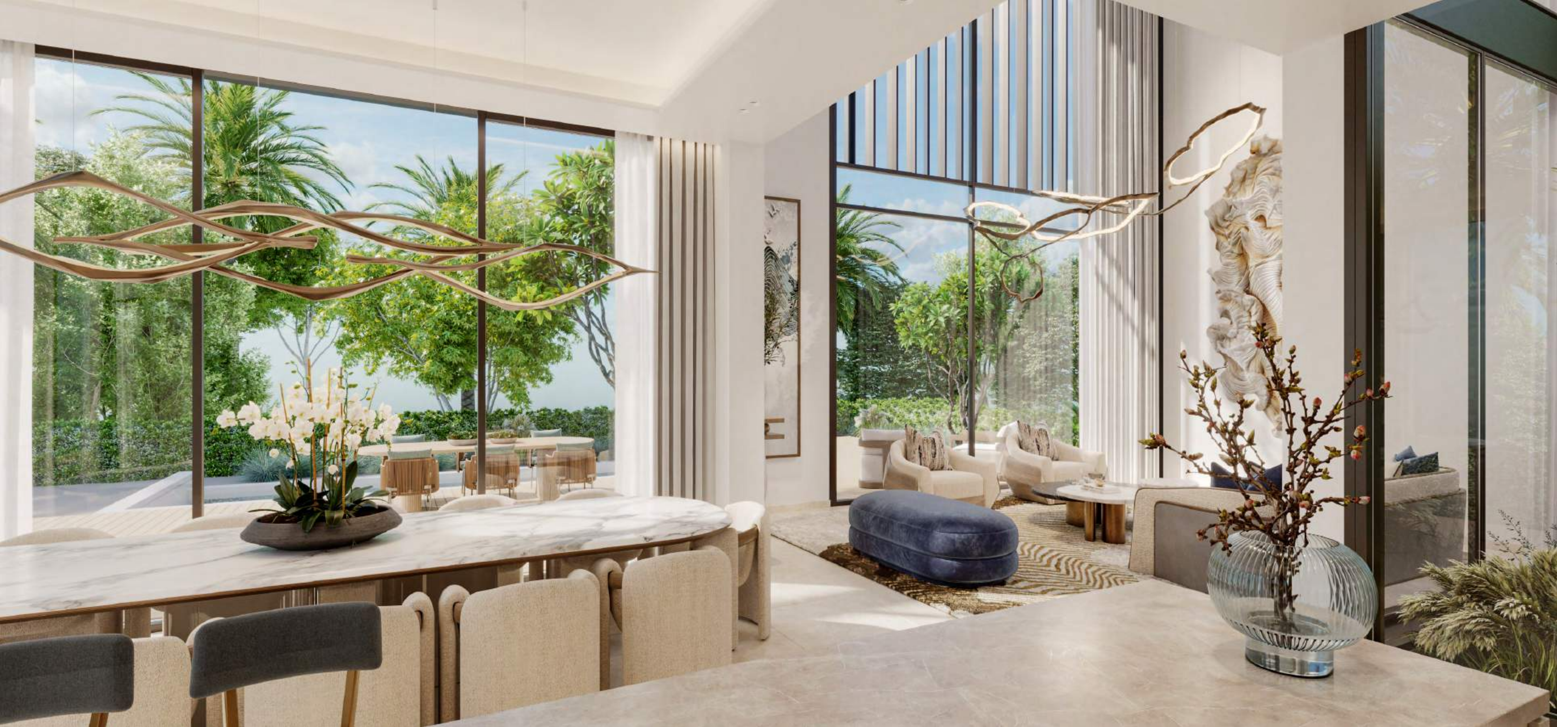
4-BEDROOM VILLA | LIVING & DINING