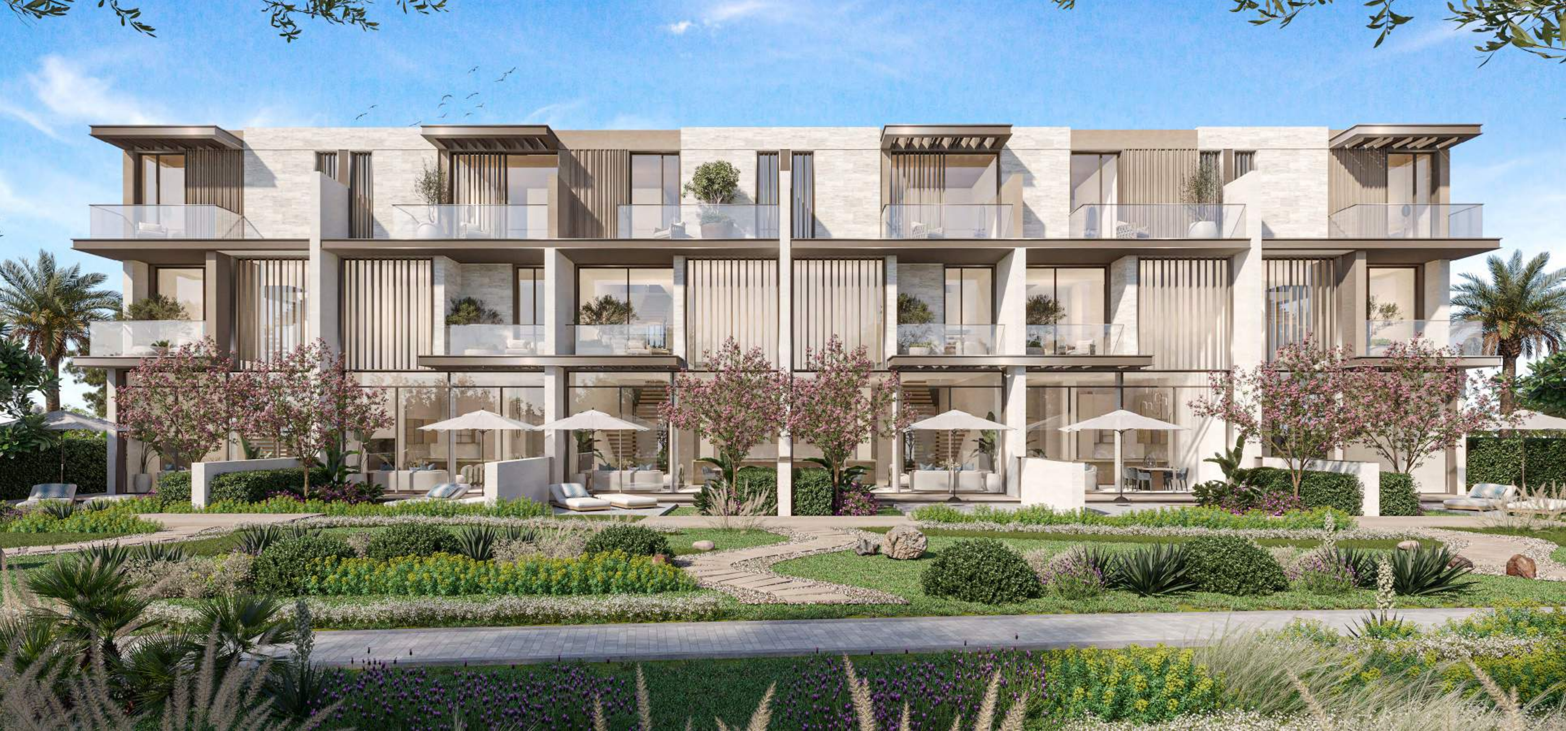
3-BEDROOM TOWNHOUSE | 6PLEX