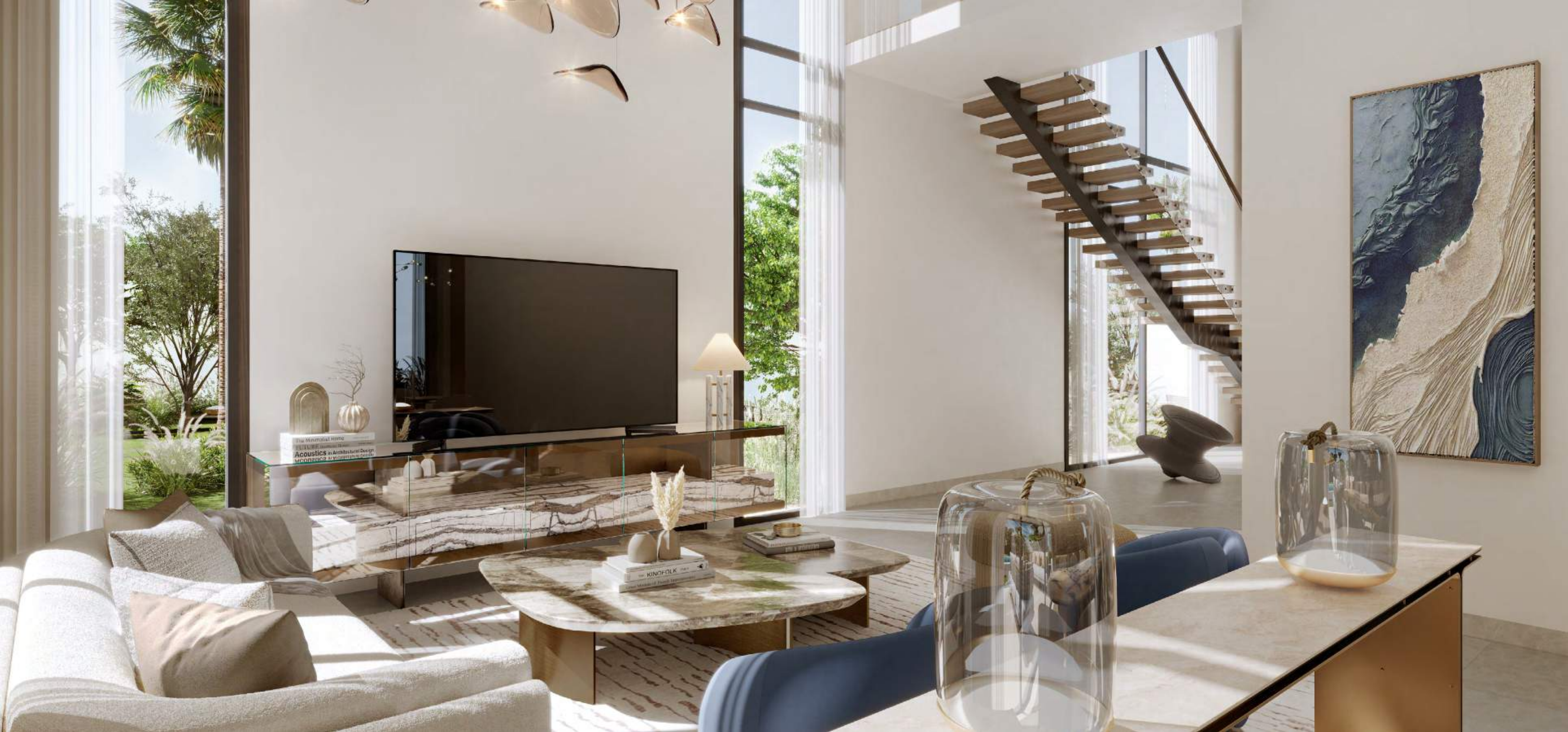
5-BEDROOM VILLA | LIVING ROOM