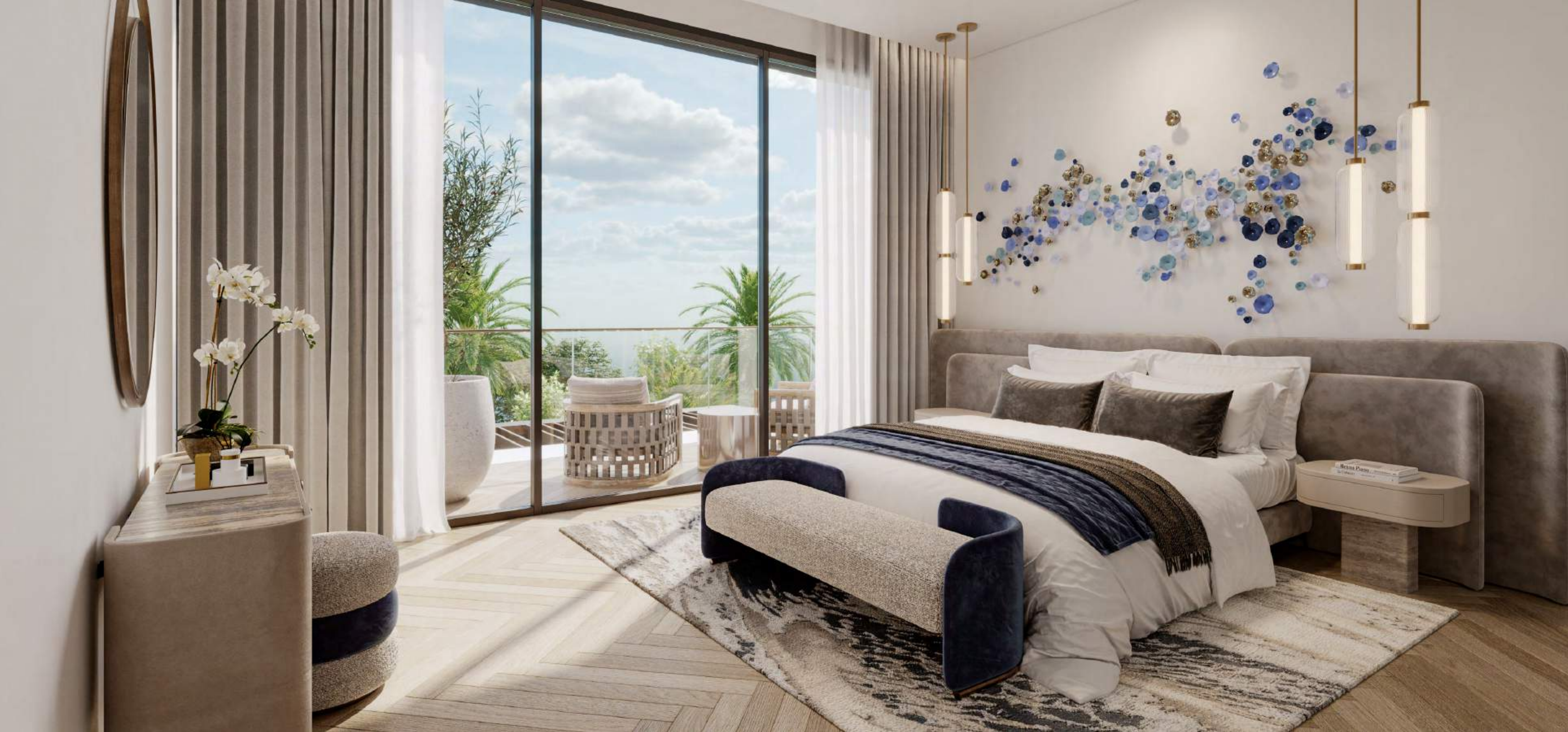
4-BEDROOM VILLA | BEDROOM