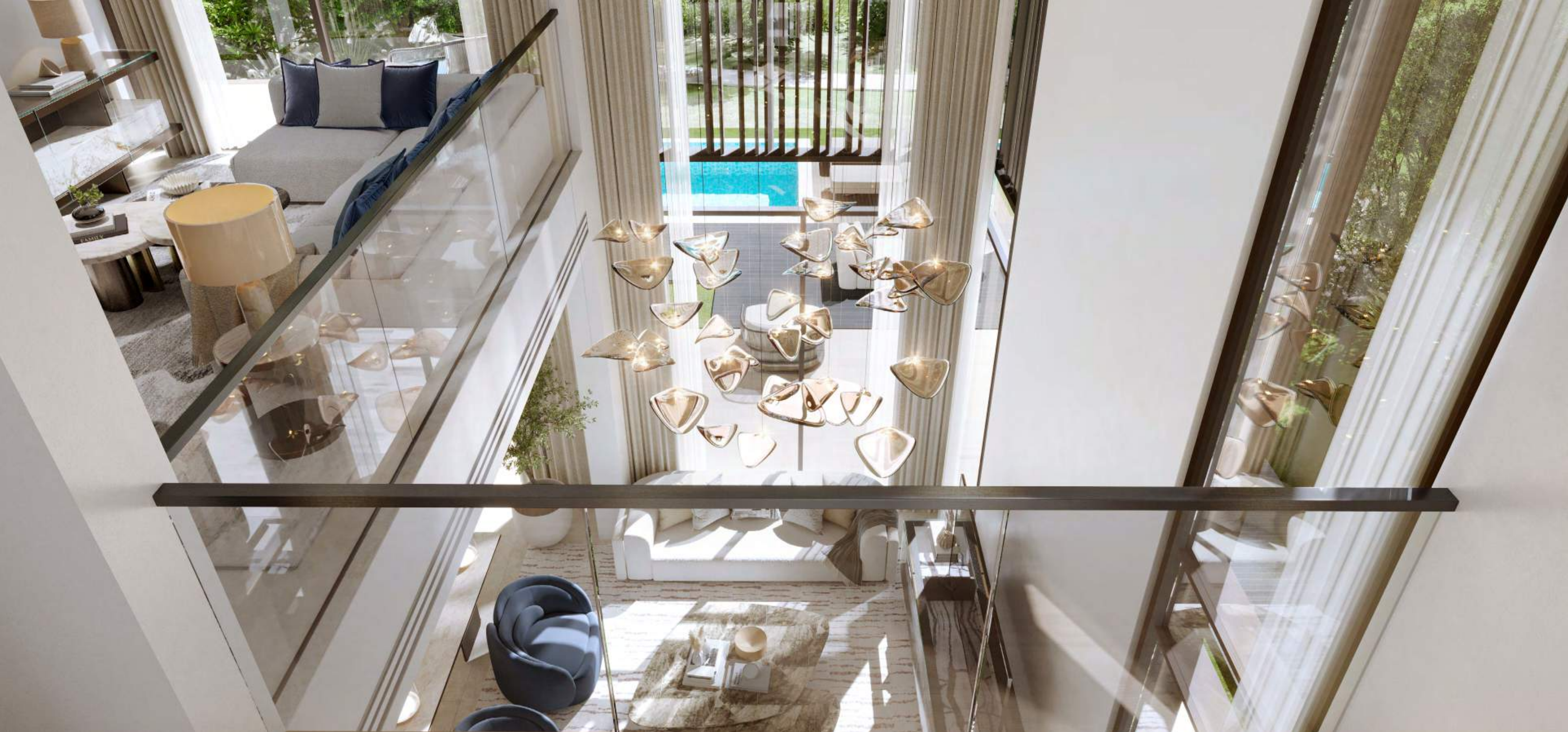
5-BEDROOM VILLA | LIVING ROOM