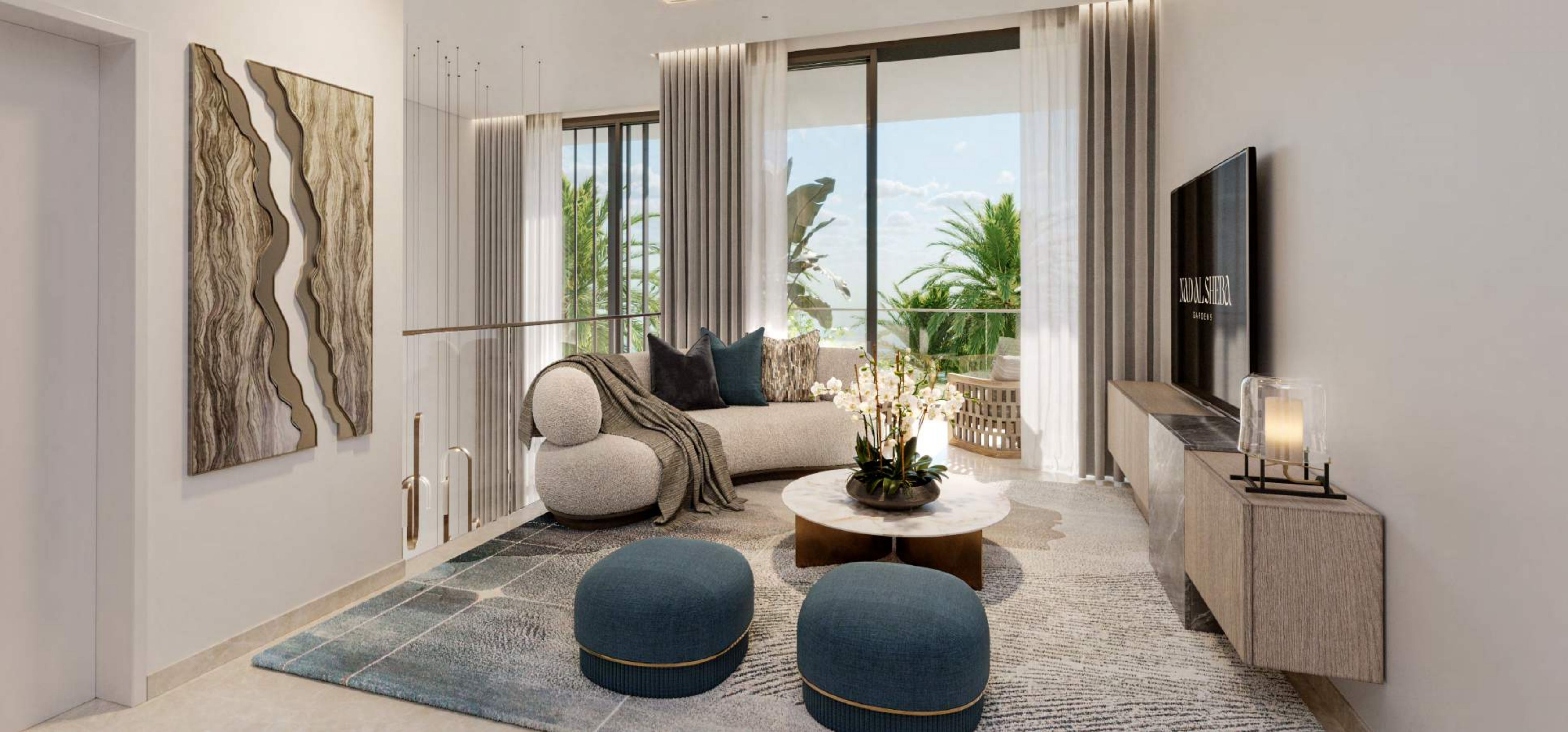
3-BEDROOM TOWNHOUSE | FAMILY ROOM