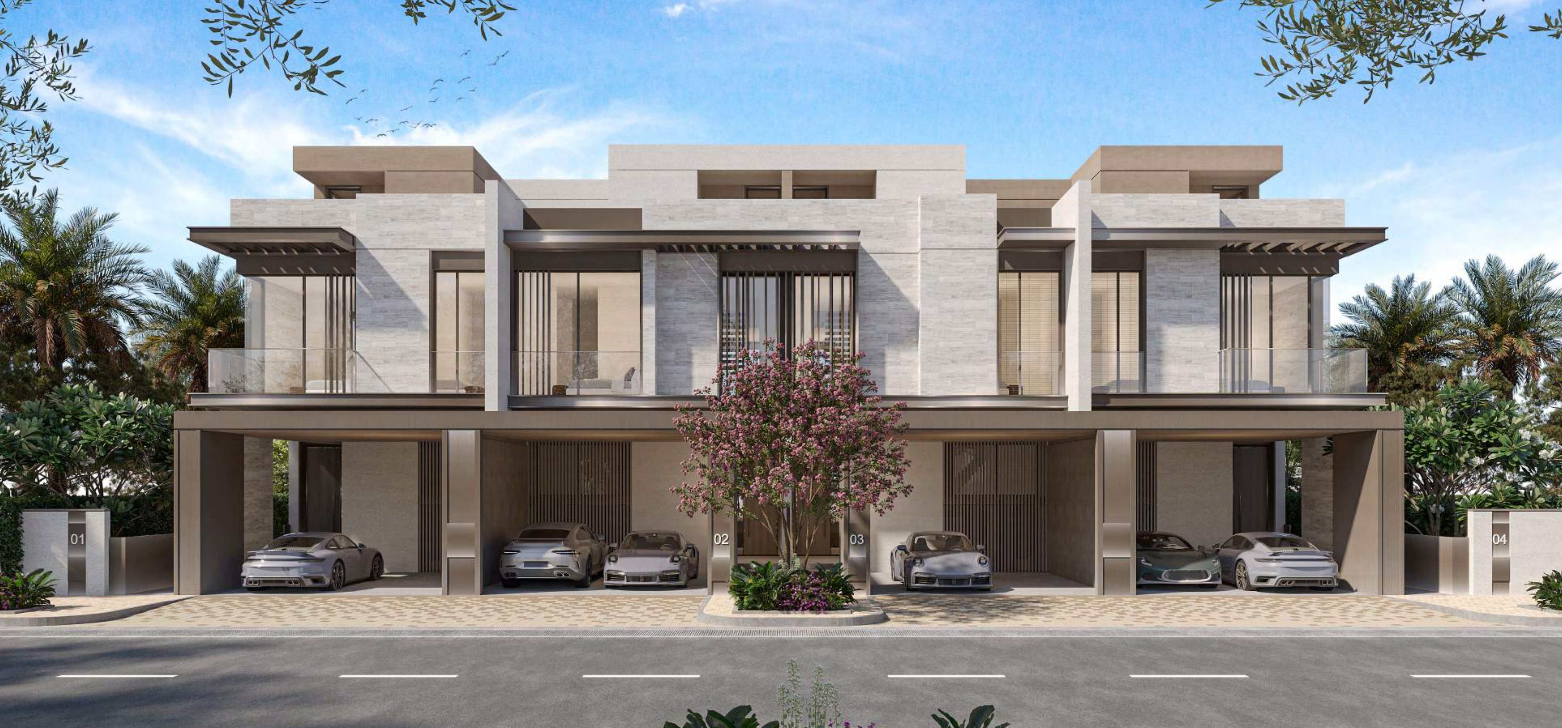
3-BEDROOM TOWNHOUSE | 4PLEX