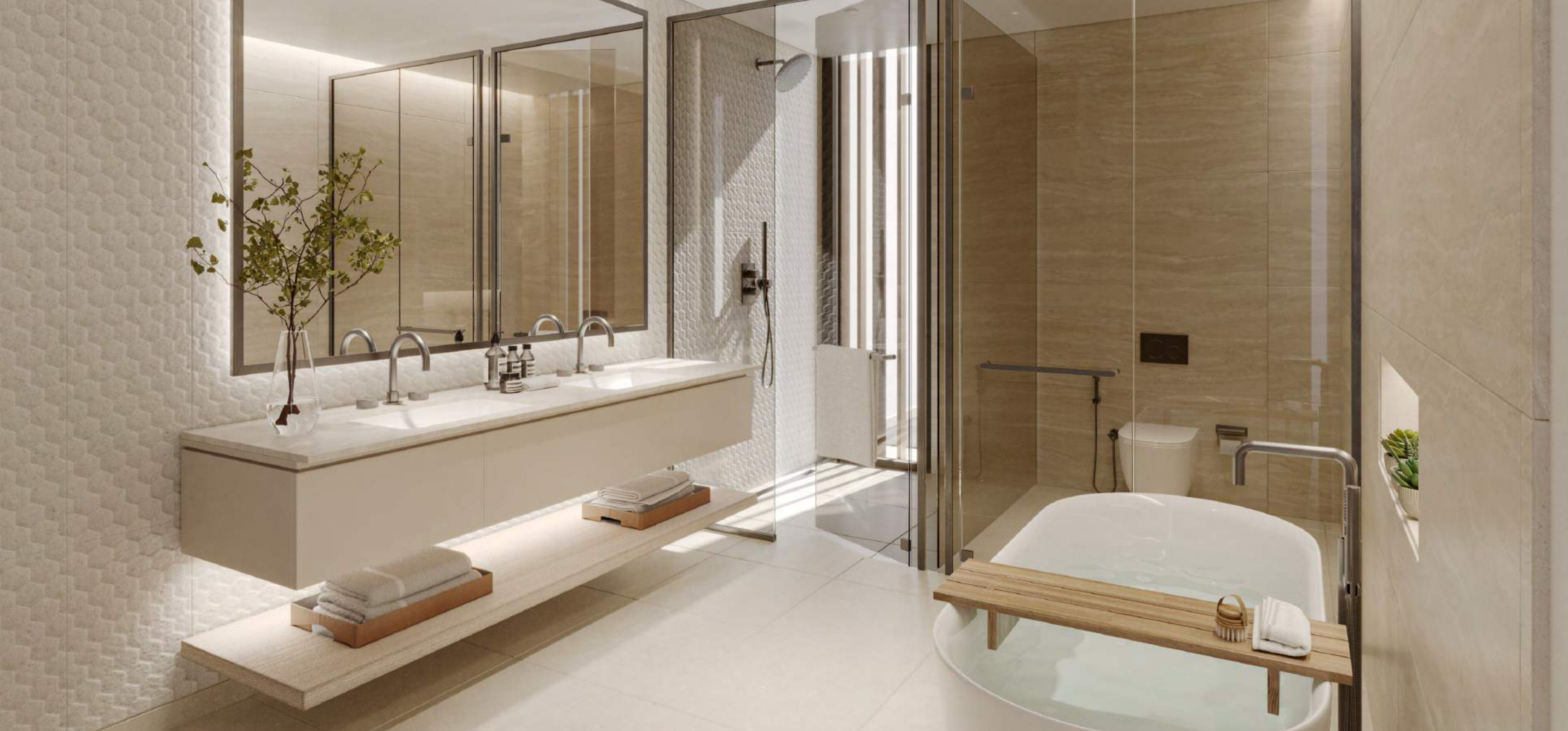
3-BEDROOM TOWNHOUSE | BATHROOM